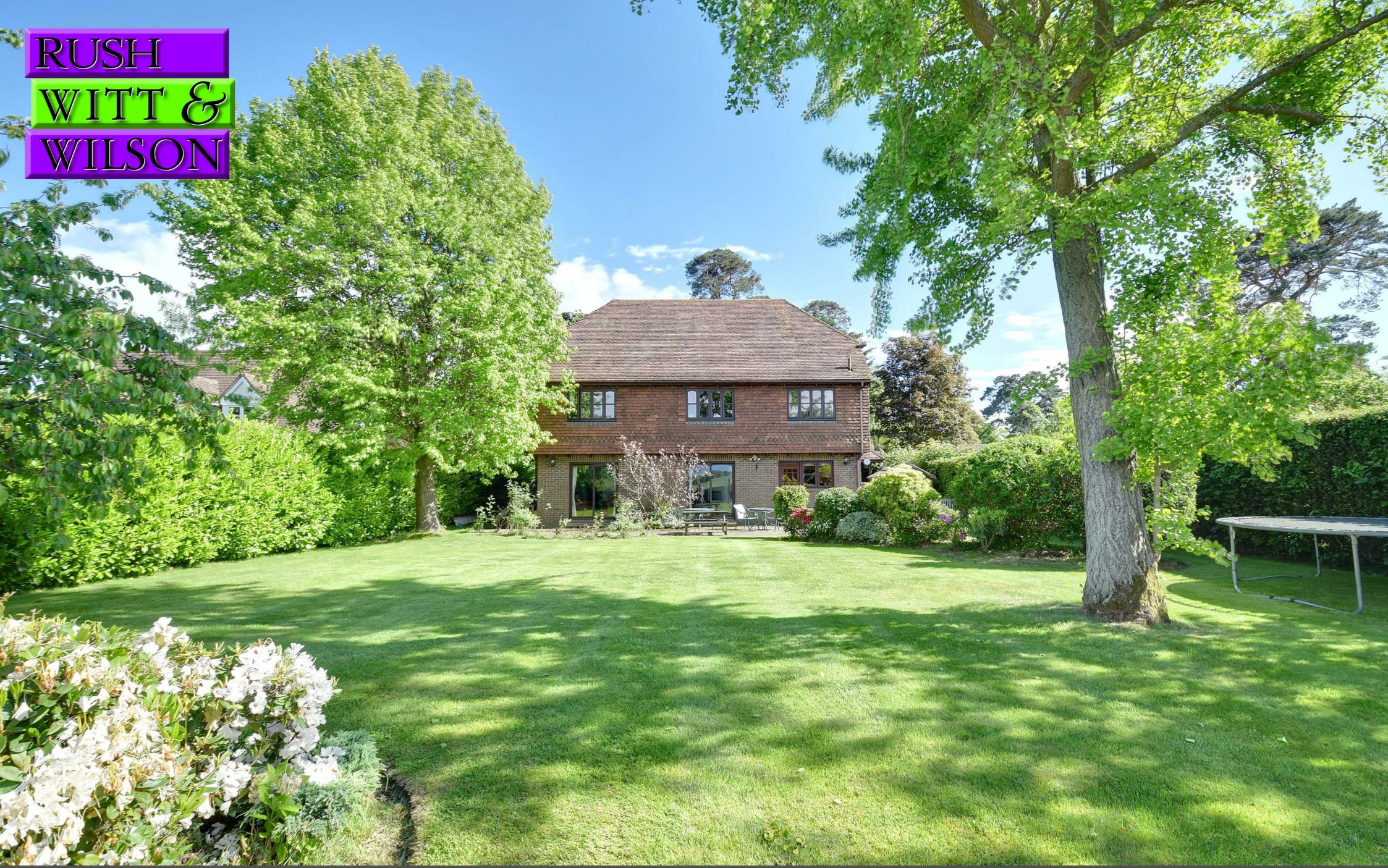
Woodstock House Tenterden Road, Rolvenden, Kent TN17 4NB Guide Price £995,000